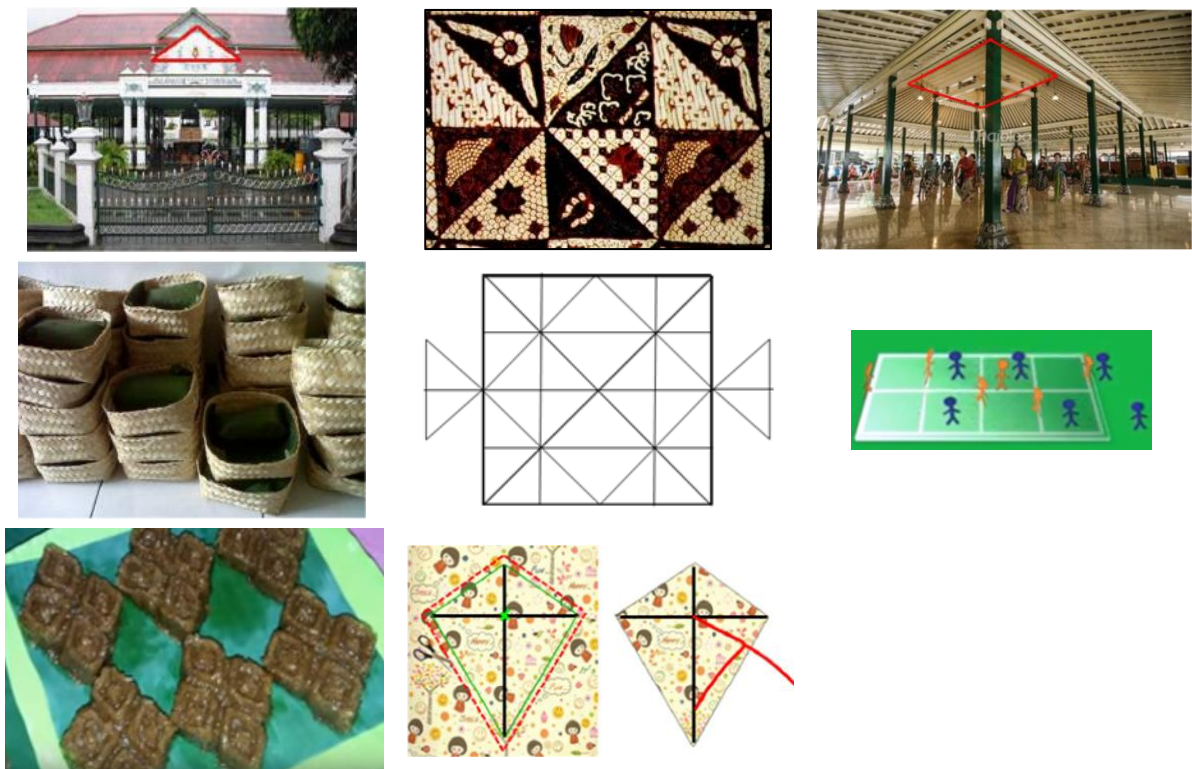
Figure 1. Results of Local Cultural Identification

To address these challenges, ethnomathematical contexts derived from Yogyakarta culture were identified and incorporated into the instructional design. These contexts included architectural features surrounding the Yogyakarta Palace, Batik Tambal motifs, Joglo house roofs, besek used in kenduri traditions, bas-basan and gobak sodor games, wajik cutting activities, and traditional kite designs. These cultural artefacts provided authentic contexts through which geometric concepts related to triangles and quadrilaterals could be explored meaningfully. Several examples of the identified cultural contexts are presented in Figure 1 .